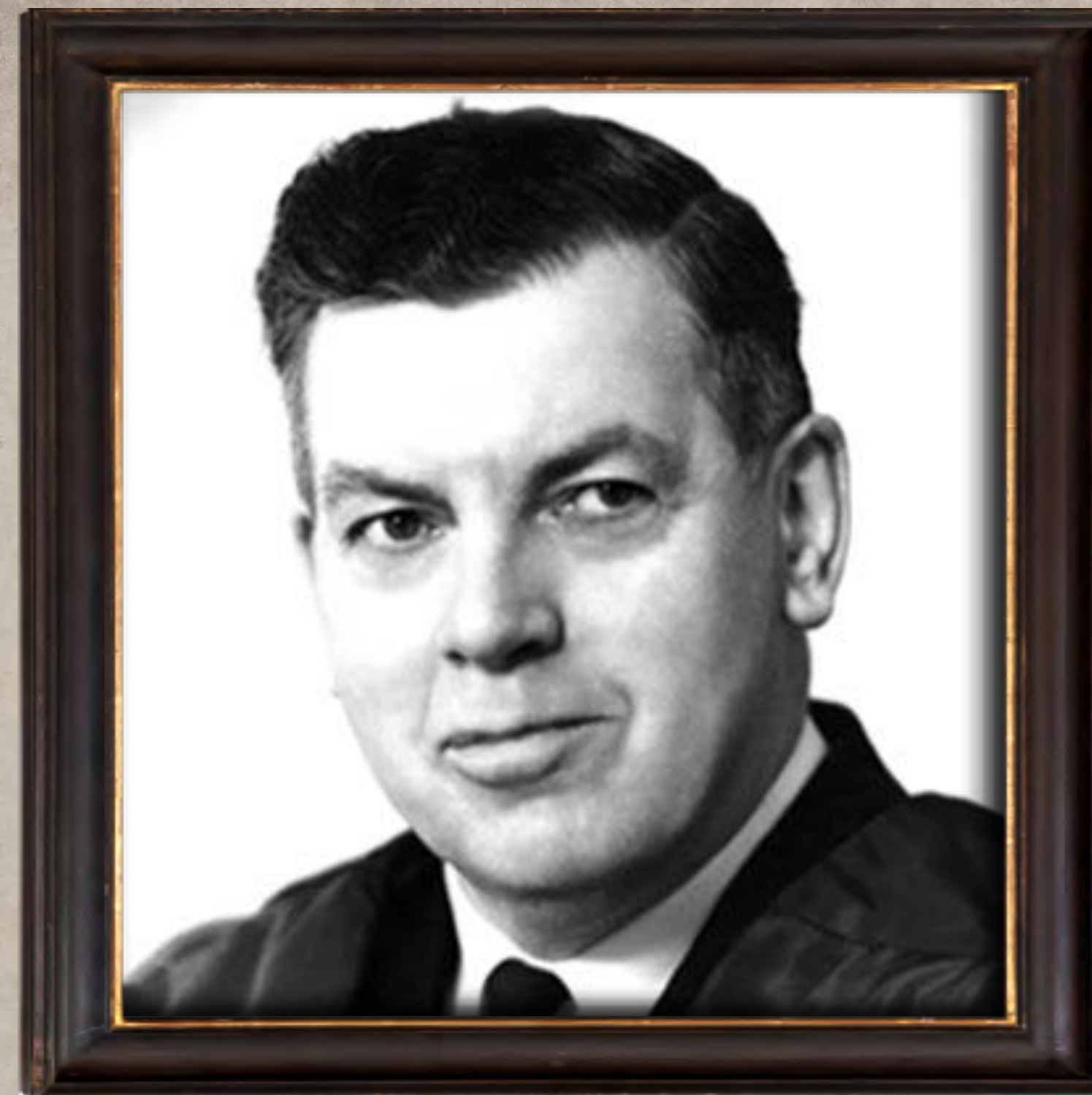
F. F. BRUCE