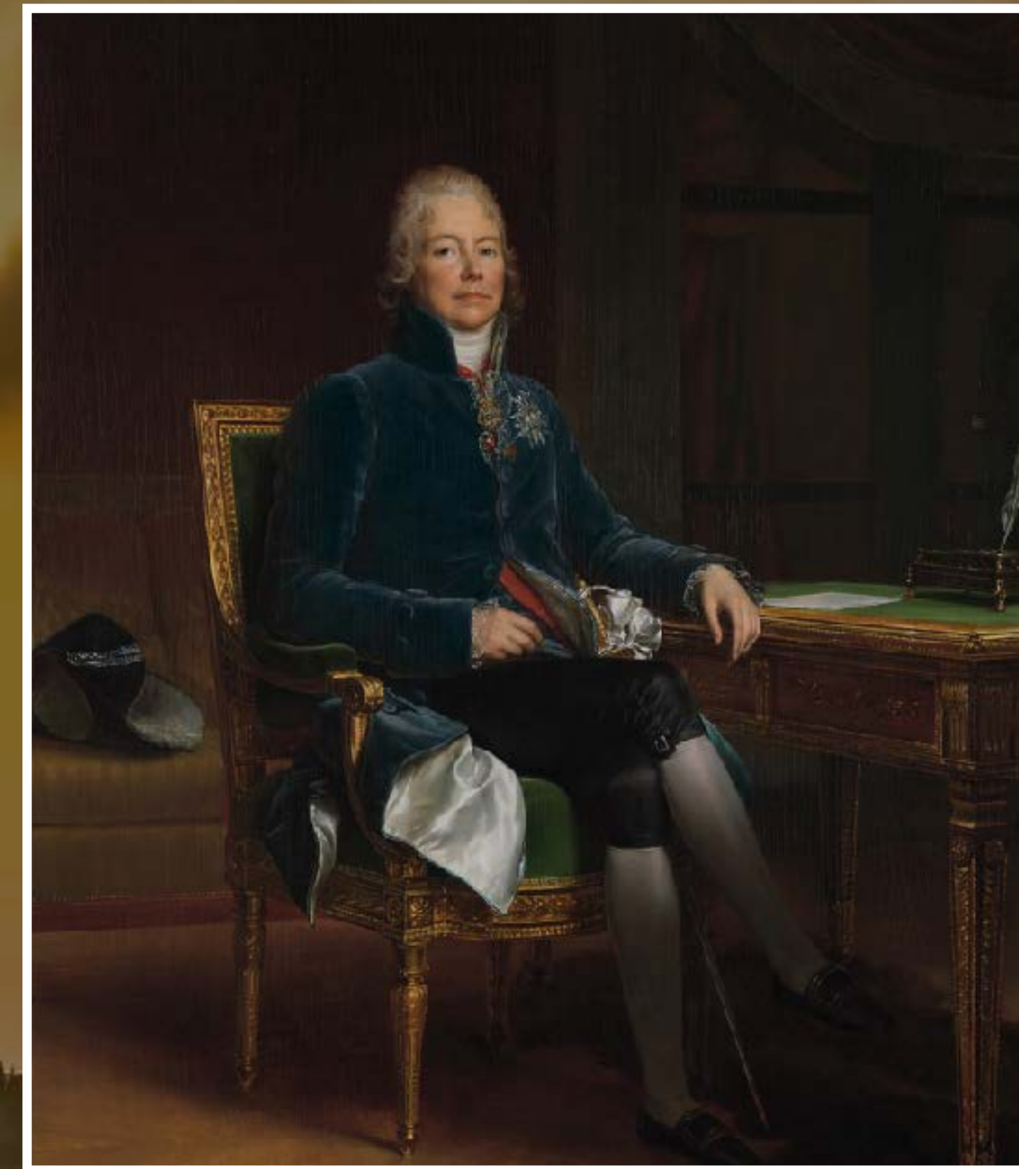
CHARLES MAURICE DE TALLEYRAND-PÉRIGORD FRENCH DIPLOMAT STATESMAN